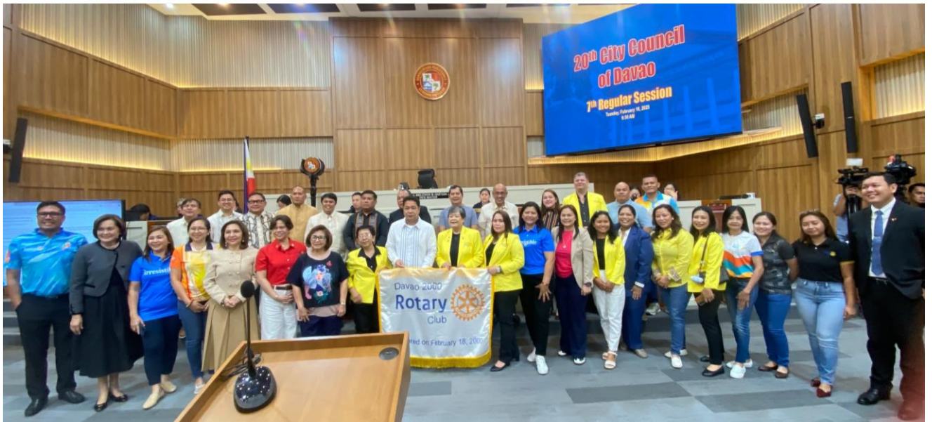
Feb. 18 - Courtesy Call at Sangguniang Panlungsod headed by RC Davao 2000