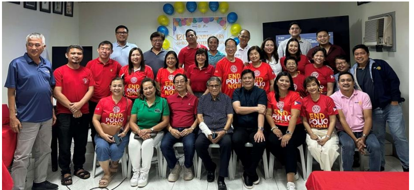
Feb. 22 - Culmination Fellowship & countdown to greet the 120 th Anniversary of Rotary International at RC North Clubhouse