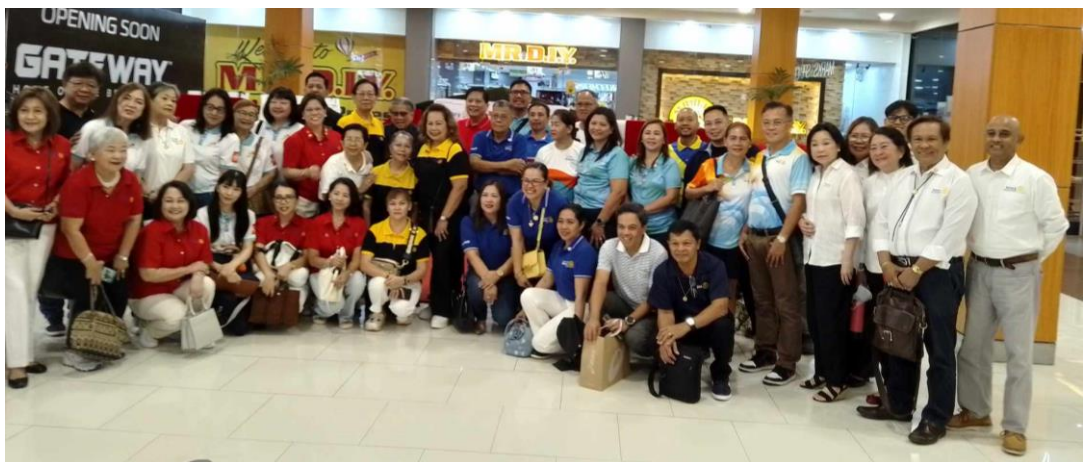
Feb. 16 – Opening and ribbon cutting of Area 2 photo exhibit