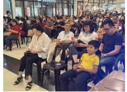
Feb. 16 - Thanksgiving Mass at Abreeza Mall